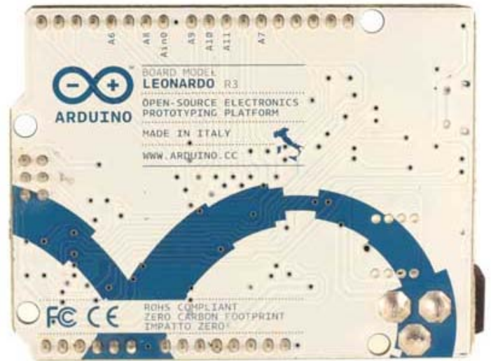
Arduino Leonardo Rear