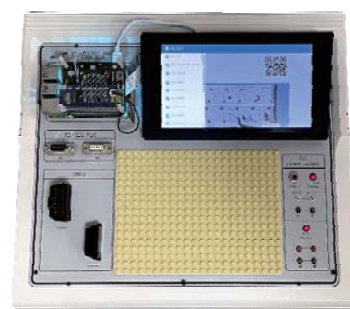
KL-82001 HMI Platform for CAN BUS